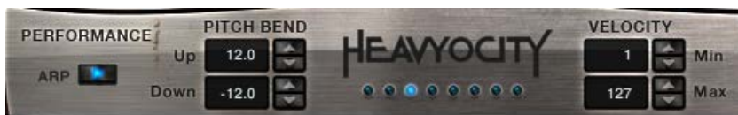
7 The Performance Section

The Performance section of the Main Page is located at the bottom of the interface. It contains the following controls: