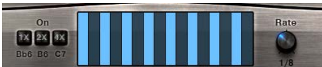
15 The Amp Sequencer Controls

The controls for the Amp Sequencer are located at the bottom of the Advanced Performance Options Page.