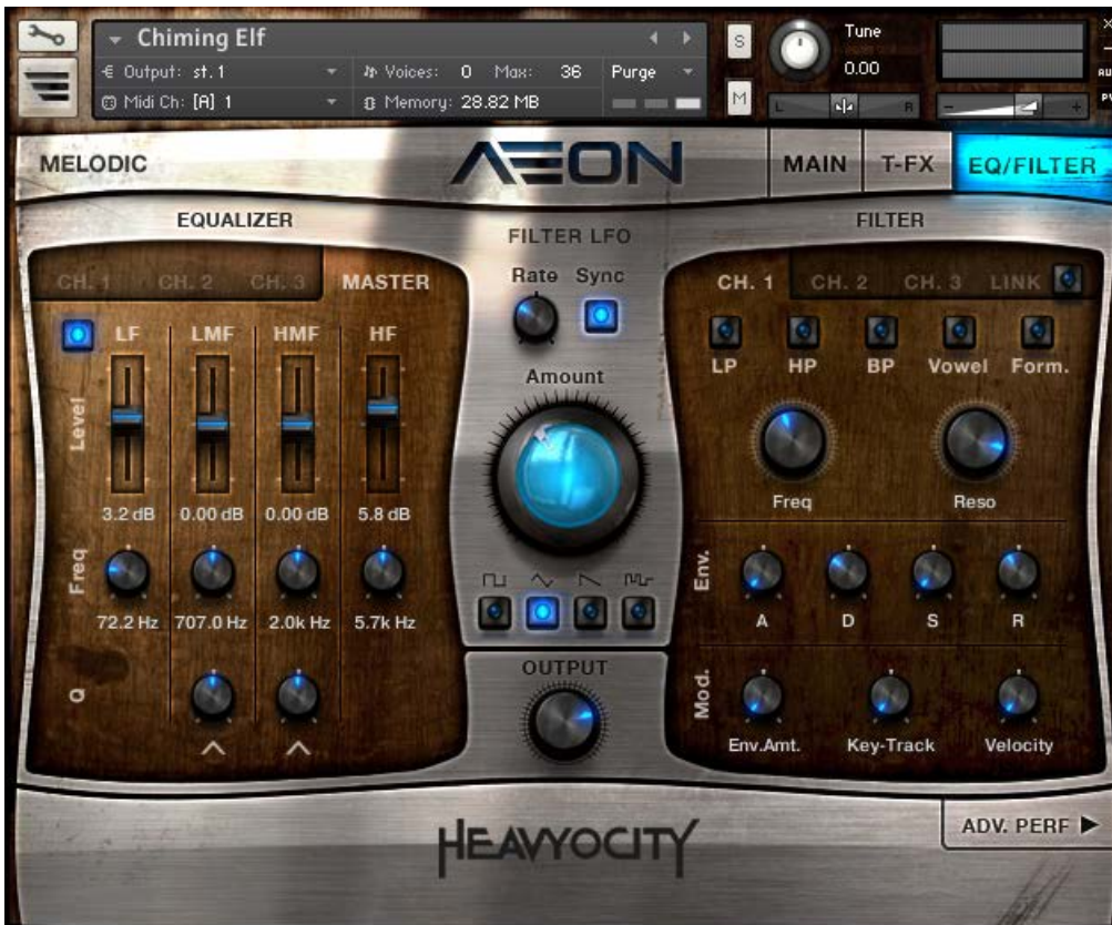
21 The EQ & Filter Page

The EQ & Filter page is where you will find controls that alter the timbre of the instrument. Each instrument contains: