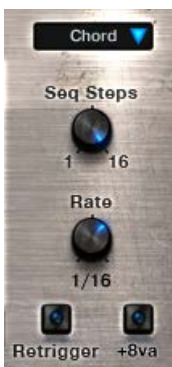
11 The Mode Controls

Apart from the pattern selection buttons and chain controls, there are three controls that are not altered by pattern selection. These are: