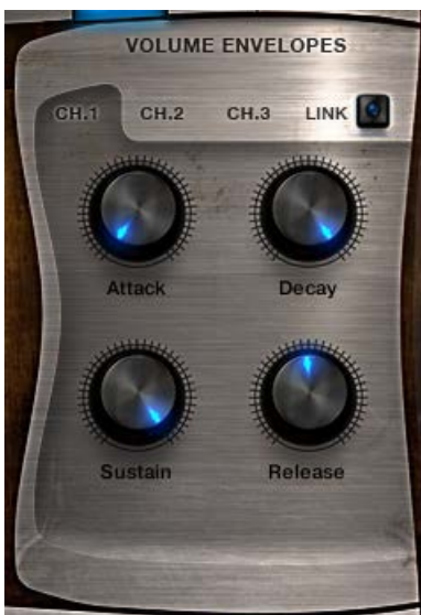
6 The Volume Envelope Section

Each of the 3 channels has its own volume envelope. The controls for a channel's volume envelope are accessed by clicking on the respective tab.