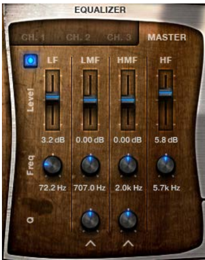
22 The Master EQ Controls

The Master EQ is accessed by clicking on the MASTER tab.