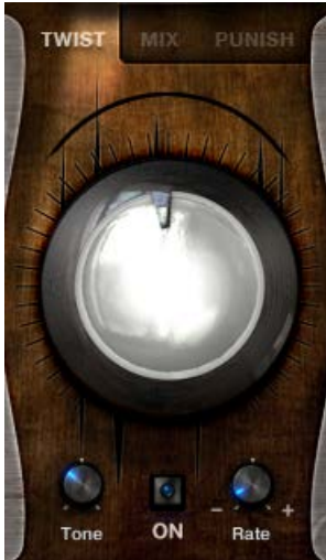
3 The Twist Controls

The twist effect is an animated, tone-altering effect that "twists" the audio. You can use it as a stationary effect to quickly alter the tone of the instrument, or you can use the animation controls to give the tone movement. The controls available are: