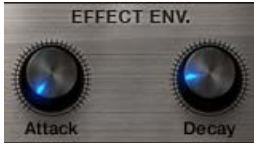
20 The Trigger FX Envelope

Between the step sequences you will also find the effect envelope. This is a simple Attack/Decay envelope that sets the fade in and fade out times for the effect when it is triggered. The controls are: