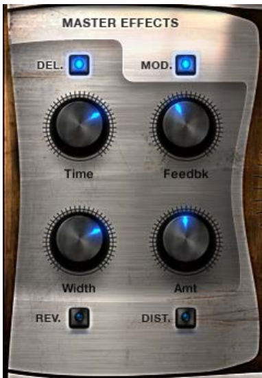
2 The Master Effects Section

Every instrument has 4 master effects, each with 4 parameter controls and an on/off switch.