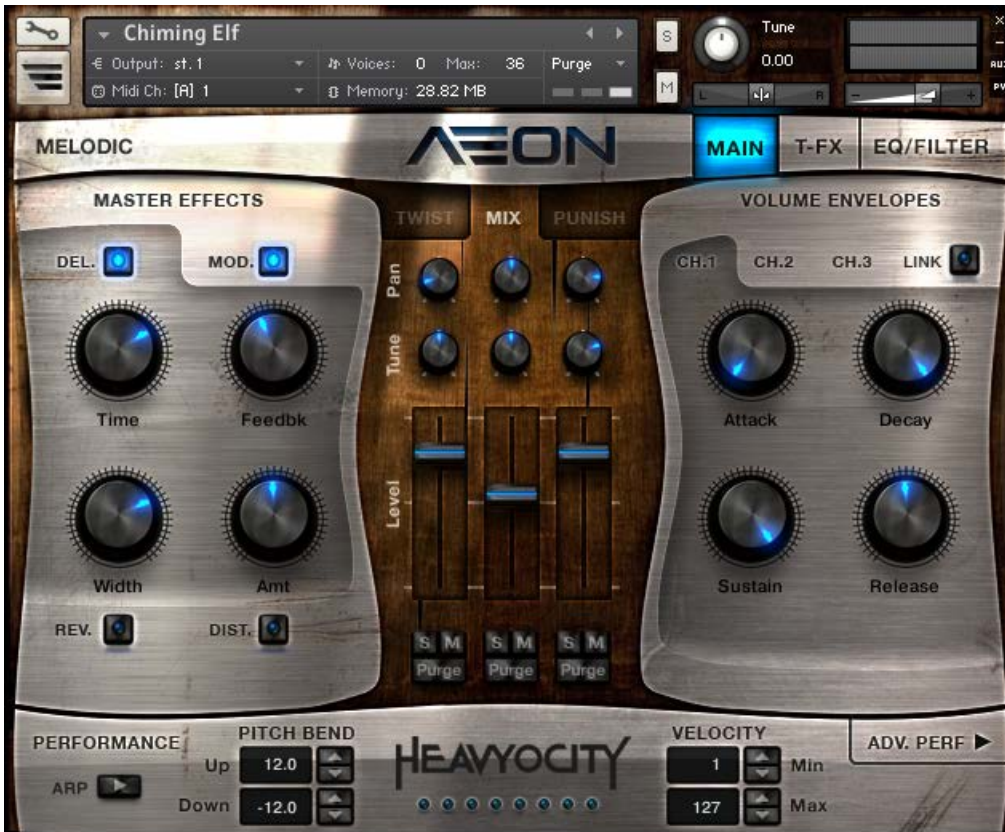
1 The AEON Melodic Interface

Every instrument in AEON Melodic shares the same interface, from which you can alter the sound or change how you play the instrument.