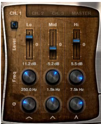
23 The Channel EQ Controls

Each channel has its own 3-band parametric EQ. To access the EQ for a channel, click on the tab with the corresponding channel number.