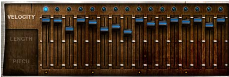
12 Arpeggiator Parameter Controls

The body of the arpeggiator section is a bank of sliders. These sliders work like a step sequencer, altering the parameter at each step according to the settings of the sliders. There are three parameters available, which are selected by using the tabs to the left: