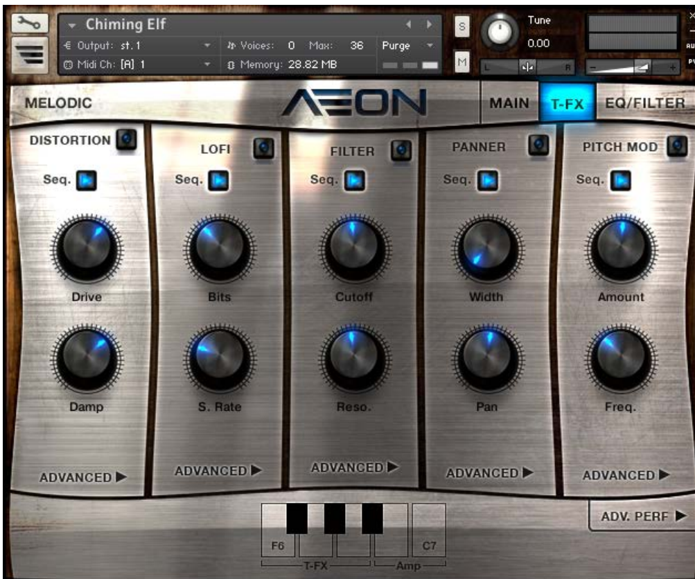
16 The Trigger FX Page

To access the Trigger FX page, click on the T-FX tab at the top of the interface.