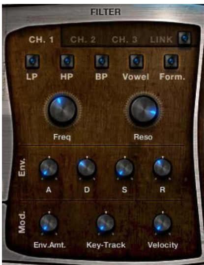
24 The Filter Controls

The filter controls are located to the right of the EQ & Filter page, under the FILTER label.