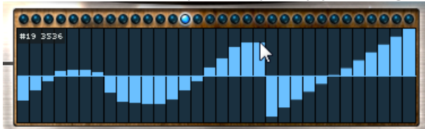
18 Drawing in a pattern

The master rate for both of the sequences is controlled by the Seq. Rate knob located between the two step sequencers.