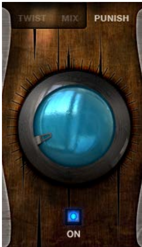
5 The Punish Knob

The Punish effect is a combination of compression and saturation controlled from a single knob. Turn the knob to punish the sound.