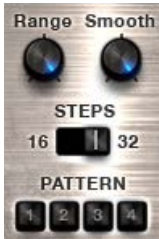
19 The sequencer controls

The additional controls are the same for each of the sequences, but control them individually.