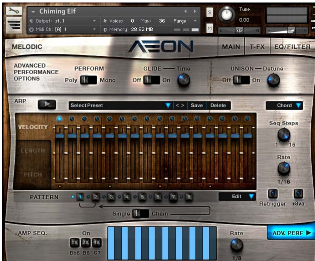
8 The Advanced Performance Options Page

This page can be accessed by clicking on the ADV. PERF button, located to the bottom right of the interface.