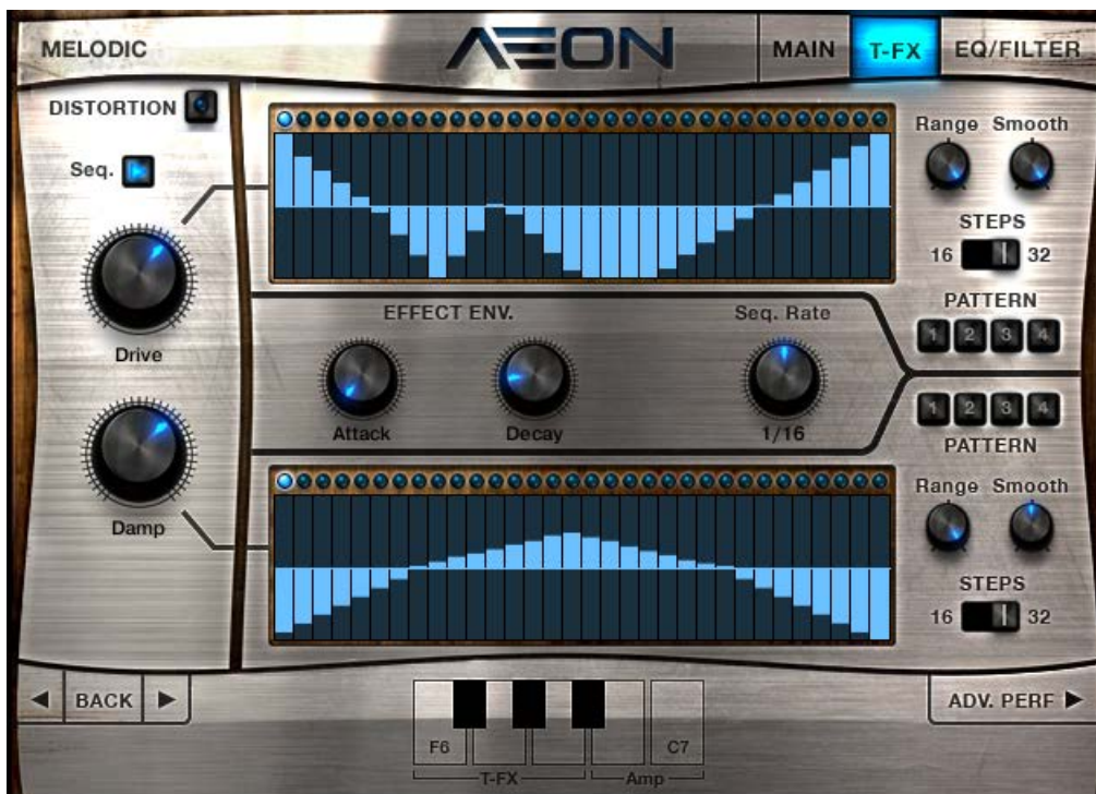
17 The Advanced Controls for the Distortion Trigger FX