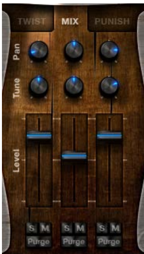
4 The Mix Controls

The Mix tab opens a 3 channel mixer for the sounds available in the instrument. These sounds will vary from instrument to instrument, but the controls will remain the same.