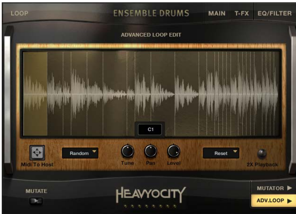
38 The Advanced Loop Edit Page

The Advanced Loop Edit page is accessed by clicking on the ADV.LOOP tab to the bottom right, under the MUTATOR tab.