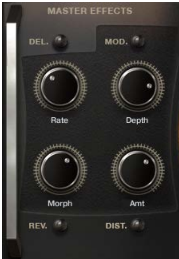
23 Modulation Effect Controls

The modulation effect is a mix of chorus and phaser effects. It can be used to thicken the sound and give a sense of movement to the instrument timbre.