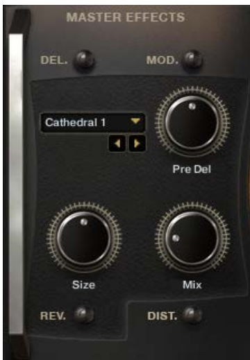
24 Reverb Effect Controls

A reverb effect is an artificial space simulator. The reverb effect used in this library is based on a technique called convolution, in which an impulse response of a real (or not) space is used to produce a faithful emulation. An impulse response can be thought of as an acoustic fingerprint, and are capable of producing the most realistic reverb effects, or crazy sounds.