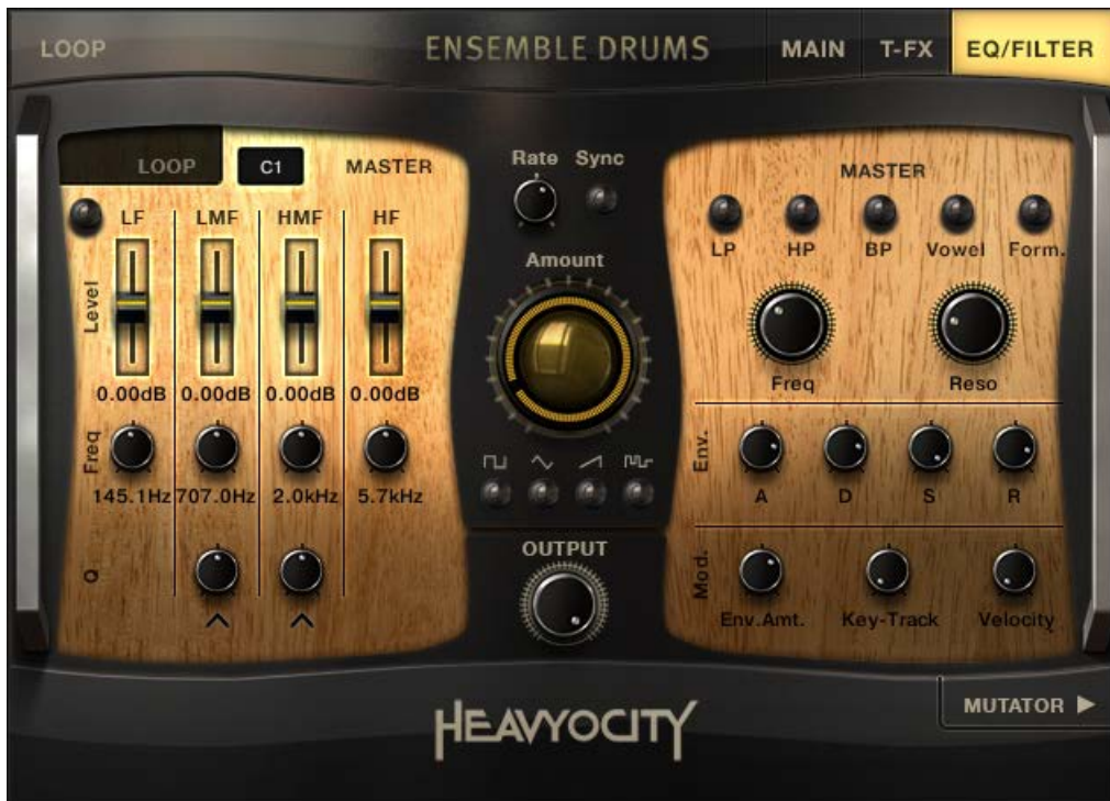
32 The Loop Menu Filter & EQ Page

The EQ & Filter page is where you will find controls that alter the timbre of the instrument.