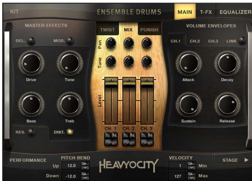
6 The Main Page of a Kit Instrument

The main page is where you will find the main sound and performance controls. This page contains 4 main areas: