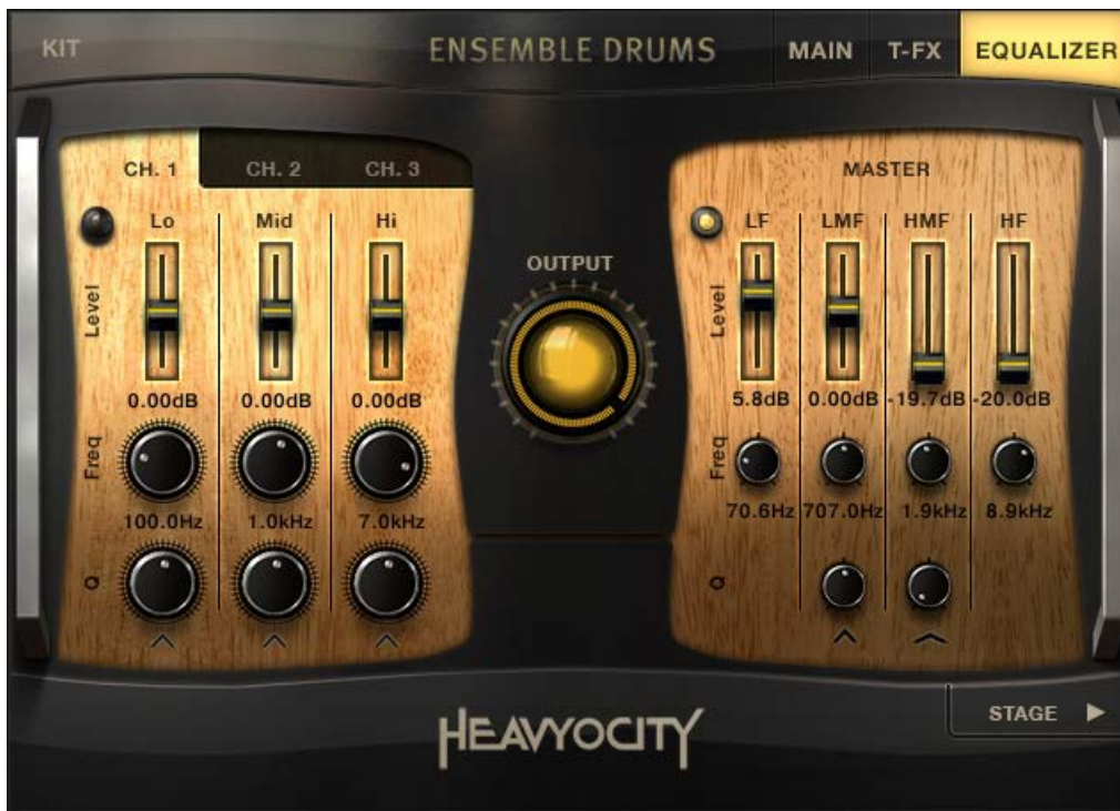
17 The Equalizer Page

The Equalizer page is where you will find controls that alter the timbre of the instrument.