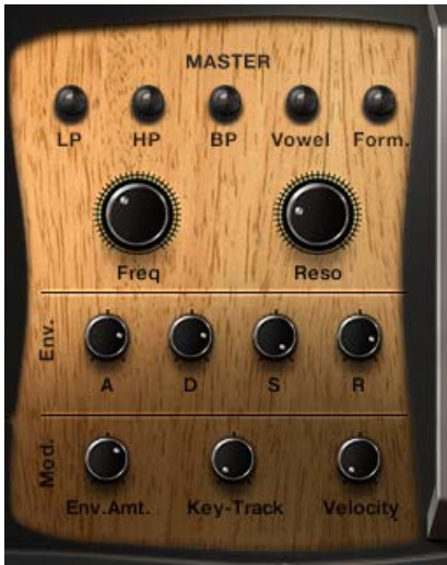
35 The Filter Controls

The Filter controls are located to the right of the EQ & Filter page.