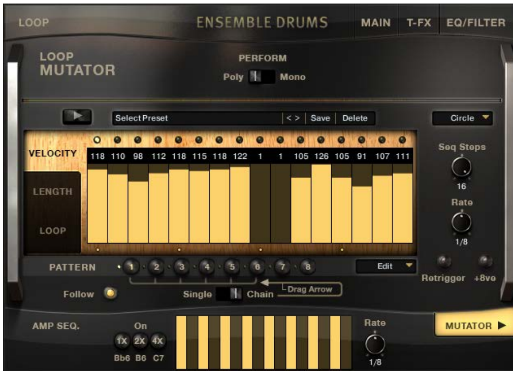
31 The Loop Mutator Page

This page can be accessed by clicking on the MUTATOR button, located to the bottom right of the interface.