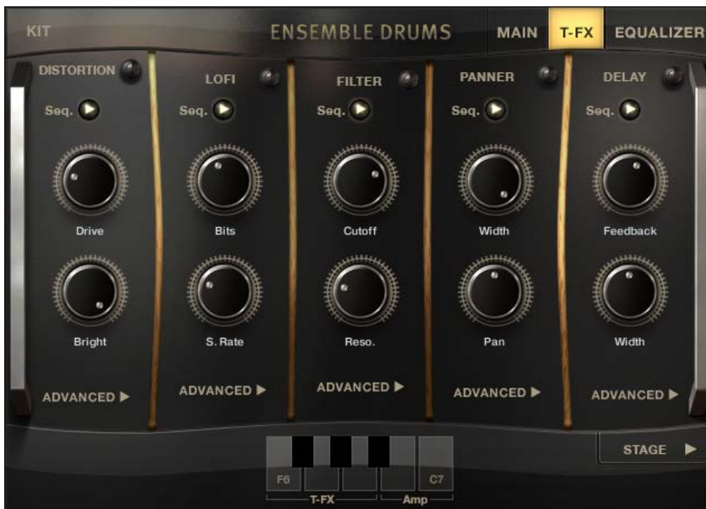
1 The Main Control Page of the Trigger FX

To access the Trigger FX page, click on the T-FX tab at the top of the interface.