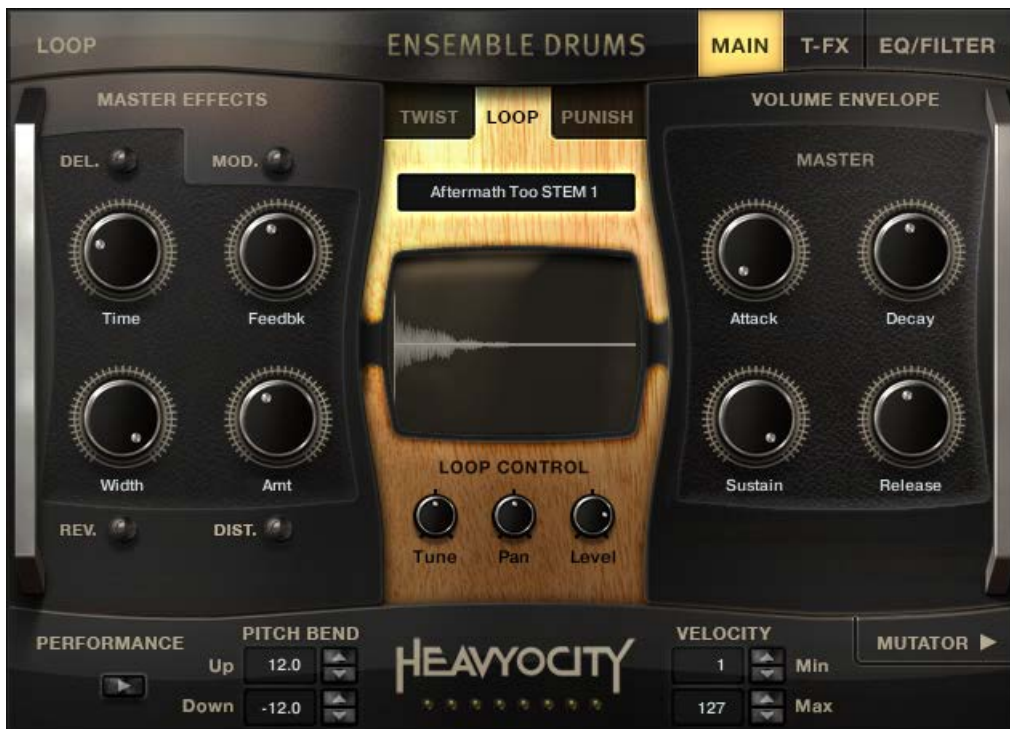
21 The Loop Menu Interface

The main page is where you will find the main sound and performance controls.