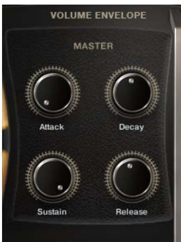
29 The Master Envelope Controls

There are 4 knobs available for the volume envelope: