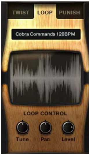
28 The Loop Controls

The LOOP tab displays a waveform, and 3 controls for altering the sounds available in the instrument.