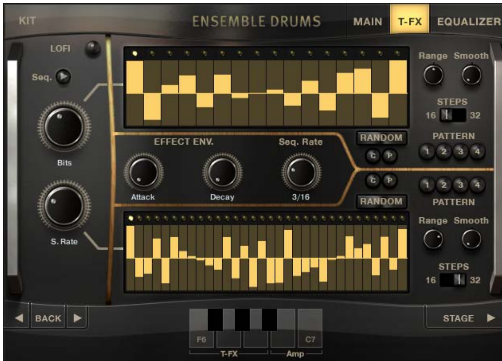
2 The Advanced Controls for the LoFi Trigger FX

With the advanced page now open, you will see the effect control column has moved to the far left position, with the advanced controls filling the rest of the page.