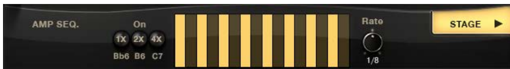
5 The Amp Sequencer Controls

The controls for the Amp Sequencer are located at the bottom of either the Stage or Loop Mutator Page.