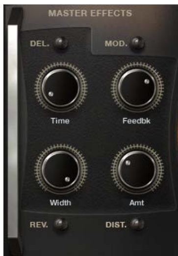
7 Delay Effect Controls

A delay effect produces a version of the signal that is delayed in time. When mixed with the original signal, this can produce an echo effect. Additional echoes can be created by feeding the delay output back into the effect input.