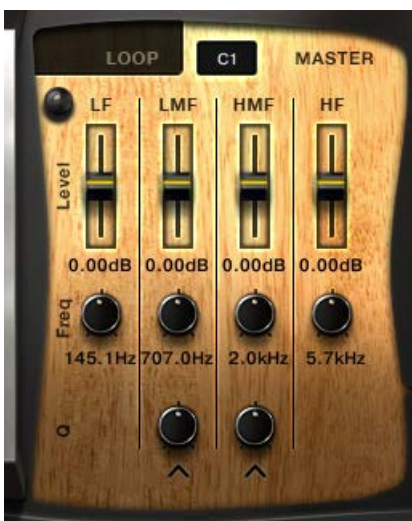
33 The Master EQ of a Kit Instrument

The Master EQ is located on the left side of the EQ/Filter Page.