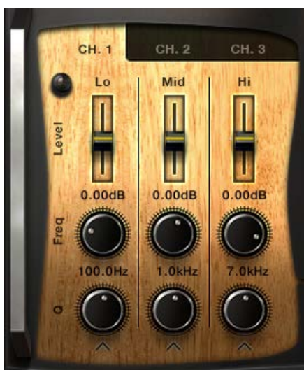
19 The Sample EQ Controls

Each channel has its own 3-band parametric EQ, the controls for which are located on the left side of the Equalizer Page.