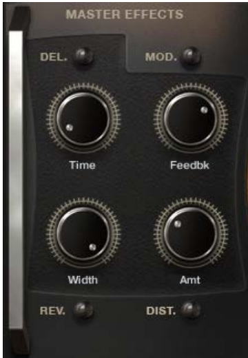
22 Delay Effect Controls

A delay effect produces a version of the signal that is delayed in time. When mixed with the original signal, this can produce an echo effect. Additional echoes can be created by feeding the delay output back into the effect input.