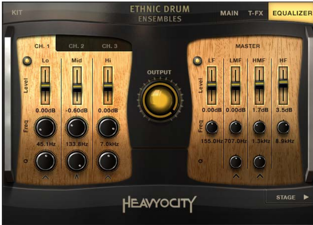
17 The Equalizer Page

The Equalizer page is where you will find controls that alter the timbre of the instrument.