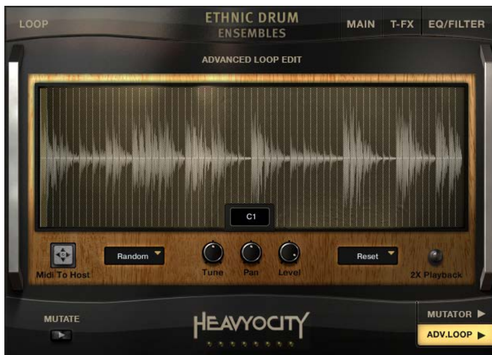
38 The Advanced Loop Edit Page

The Advanced Loop Edit page is accessed by clicking on the ADV.LOOP tab to the bottom right, under the MUTATOR tab.