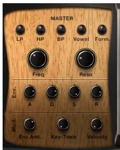
35 The Filter Controls

The Filter controls are located to the right of the EQ & Filter page.