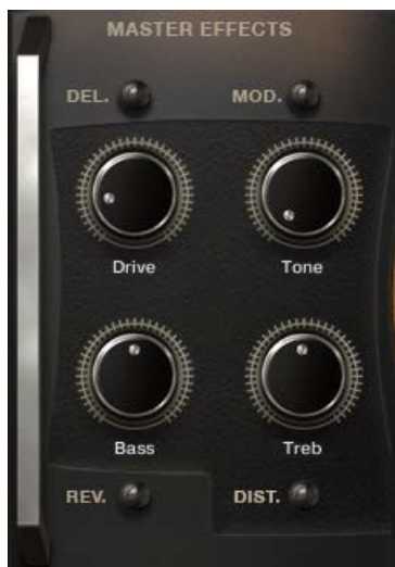
25 Distortion Effect Controls

The distortion effect emulates the sound of an overdriven analogue circuit. This makes the sound "heavier" by adding overtones and compressing the dynamics.