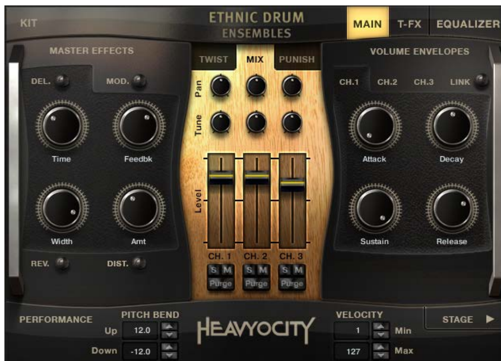
6 The Main Page of a Kit Instrument

The main page is where you will find the main sound and performance controls. This page contains 4 main areas: