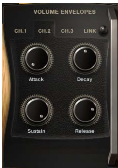
14 The Envelope Controls

Each of the 3 channels has its own volume envelope. The controls for a channel's volume envelope are accessed by clicking on the respective tab.