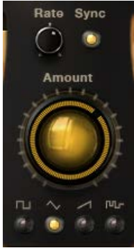
36 The Filter LFO Controls

The central area of the EQ & Filter page is the Filter LFO section. An LFO is a Low Frequency Oscillator, used to modulate parameters. The Filter LFO is connected to the cutoff parameter of all of the filters.