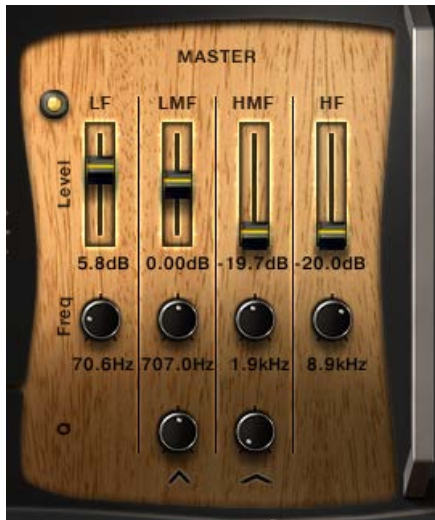
18 The Master EQ of a Kit Instrument

The Master EQ is located on the right side of the Equalizer Page.