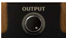
37 The Output Knob

In the center of the Equalizer Page is one final control: the OUTPUT knob.