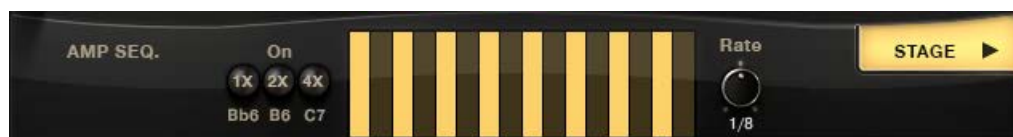
5 The Amp Sequencer Controls

The controls for the Amp Sequencer are located at the bottom of either the Stage or Loop Mutator Page.