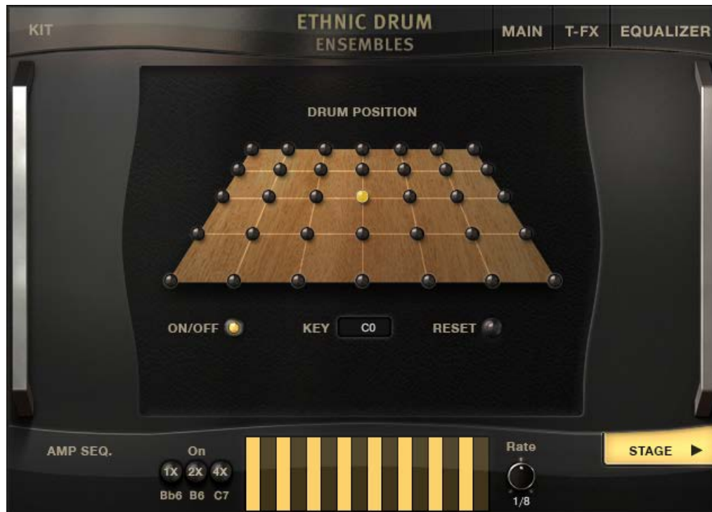
16 The Stage Page

The Stage page can be accessed by clicking on the navigation tab to the bottom right of the interface.