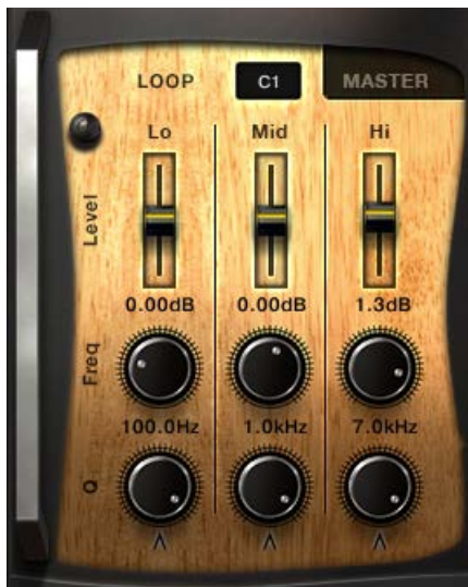
34 The Loop EQ Controls

Each loop has its own 3-band parametric EQ. To access the EQ for a loop, click on the LOOP tab.