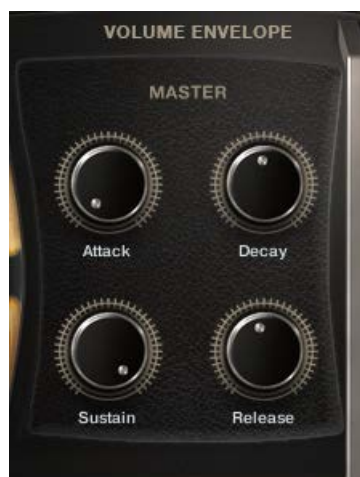
29 The Master Envelope Controls

There are 4 knobs available for the volume envelope: