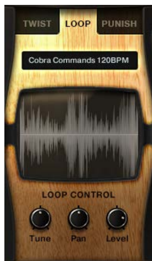
28 The Loop Controls

The LOOP tab displays a waveform, and 3 controls for altering the sounds available in the instrument.