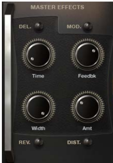
7 Delay Effect Controls

A delay effect produces a version of the signal that is delayed in time. When mixed with the original signal, this can produce an echo effect. Additional echoes can be created by feeding the delay output back into the effect input.