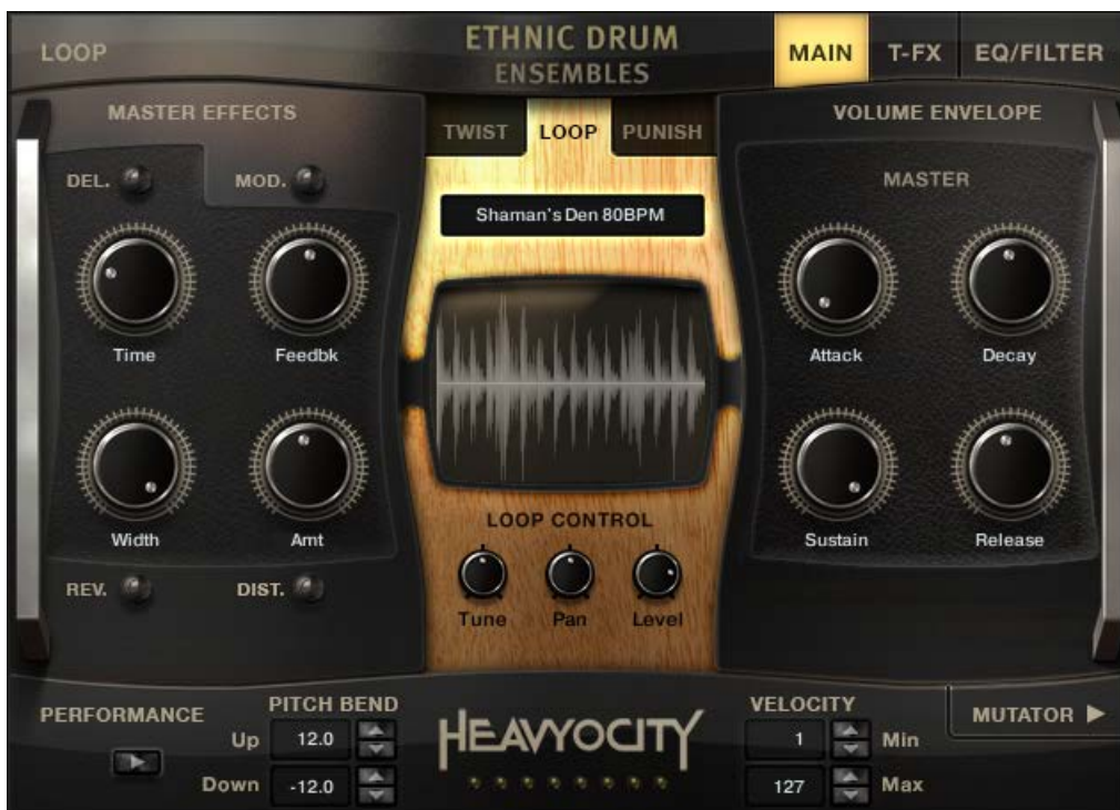
21 The Loop Menu Interface

The main page is where you will find the main sound and performance controls.