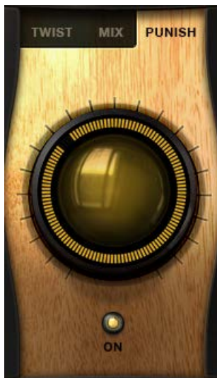
27 Punish Controls

The Punish effect is a combination of compression and saturation controlled from a single knob. Turn the knob to punish the sound.