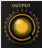
20 The Output Knob

In the center of the Equalizer Page is one final control: the OUTPUT knob.