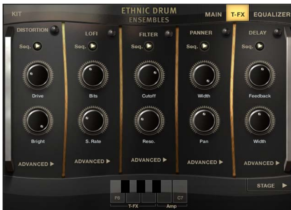
1 The Main Control Page of the Trigger FX

To access the Trigger FX page, click on the T-FX tab at the top of the interface.