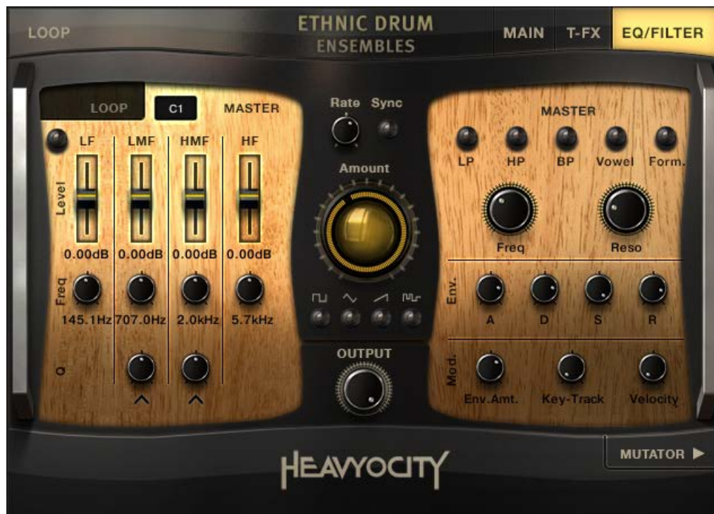
32 The Loop Menu Filter & EQ Page

The EQ & Filter page is where you will find controls that alter the timbre of the instrument.