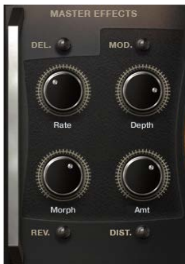
23 Modulation Effect Controls

The modulation effect is a mix of chorus and phaser effects. It can be used to thicken the sound and give a sense of movement to the instrument timbre.