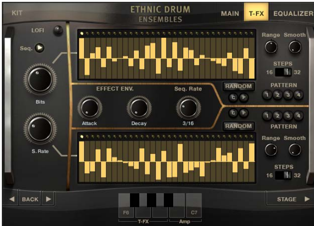
2 The Advanced Controls for the LoFi Trigger FX

With the advanced page now open, you will see the effect control column has moved to the far left position, with the advanced controls filling the rest of the page.