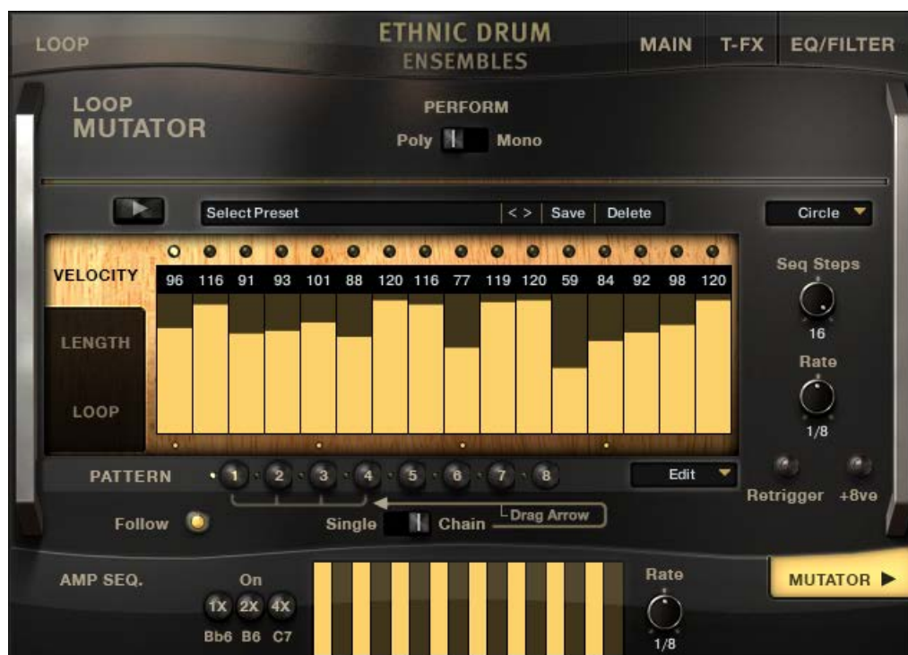
31 The Loop Mutator Page

This page can be accessed by clicking on the MUTATOR button, located to the bottom right of the interface.