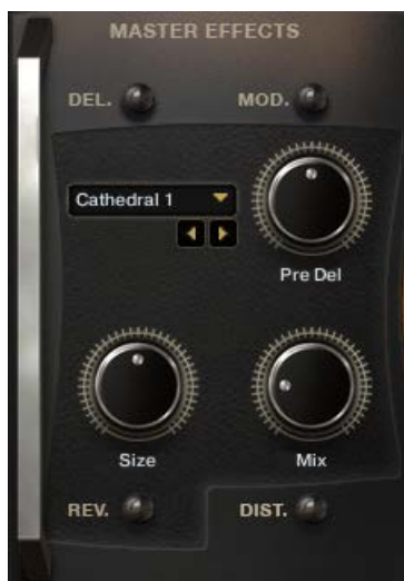
24 Reverb Effect Controls

A reverb effect is an artificial space simulator. The reverb effect used in this library is based on a technique called convolution, in which an impulse response of a real (or not) space is used to produce a faithful emulation. An impulse response can be thought of as an acoustic fingerprint, and are capable of producing the most realistic reverb effects, or crazy sounds.