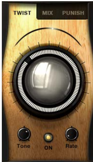
11 Twist Controls

The twist effect is an animated, tone-altering effect that twists the audio. You can use it as a stationary effect to quickly alter the tone of the instrument, or you can use the animation controls to give the tone movement. The controls available are: