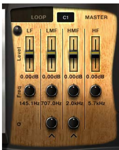
33 The Master EQ of a Kit Instrument

The Master EQ is located on the left side of the EQ/Filter Page.